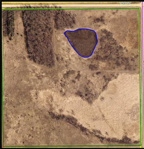
Ringneck Wildlife Area Wetland

Because of the soil type, portions of the property have always been poorly drained, especially in the spring when upland game birds are nesting. These wet areas primarily are composed of a single species stand of Reed Canary Grass, which provides little in the way of quality nesting cover or food. Of the 7 acres of suitable wetland construction, the Conservation Board decided to focus on 1.4 acres on the north end of the property.