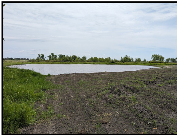
Ringneck Wildlife Area Wetland

Now, not only does the area support the upland and forest game species, but also benefits many species of ducks, geese, snipe, rail, sandpipers, plovers, frogs, and turtles. Diversity of the site doesn't stop with just the birds and animals, but also the vast array of plant life and aquatic species that will establish on their own overtime. Wetlands play a very important roll within a watershed. They help slow down runoff and nutrient filled sediment. Wetland vegetation will filter and absorb chemicals naturally, and they help recharge ground water supply. We were glad to see this project through in a timely manner and are grateful for the support of the Wildlife Habitat Stamp Grant. The new wetland is a short walk from the parking lot, making it an easy place to get out to observe the wildlife using it, or with the upcoming waterfowl seasons, this may be a great place to try hunting.